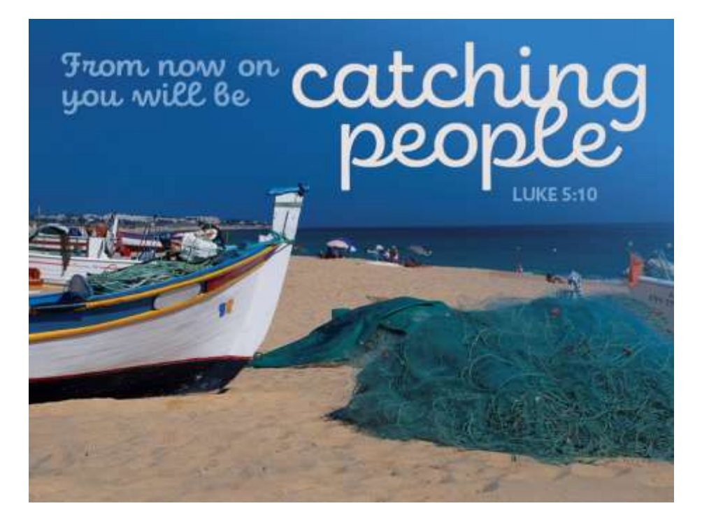
February 9, 2025 | 9:00 a.m.

Kviteseid Lutheran Church 308 North Third Street Milan, Minnesota